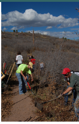
Trail crew working on a trail in the work center

The additional trail nights are typically smaller groups, focused on trail maintenance that is permanent, effective and safe for all users. We are also trying to restore some of the more damaged areas, by reseeding and using natural materials to prevent more damage. If